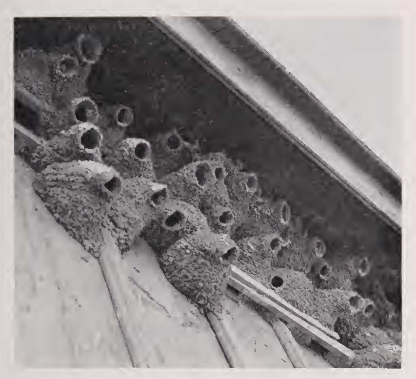
Figure 1. The use of horizontal strips for nesting. This is one of the most important techniques in Cliff Swallow management.

contracted diarrhea and died later. In telling me of the birds that had died, Mr. Bodeman said, "I picked up a milk pail full of the birds and took them to Deerfield so the people could see them." From that year to the present, only part of the old nests were knocked down before the birds arrived in the spring. If a sudden cold wave occurred, the swallows made use of the remaining old nests for protection. After nesting was well under way and the danger of low temperatures was past, all of the old nests were removed.